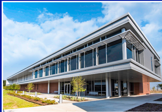
ExxonMobil Petrochemical and Advanced Technology Center